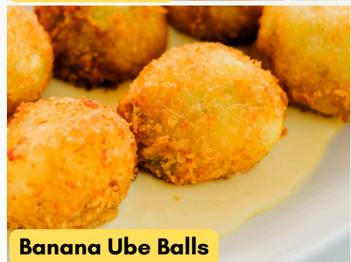
Banana Ube Balls