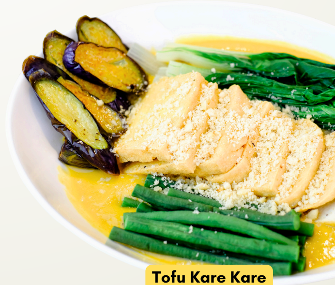
Tofu Kare Kare

PRICES INCLUSIVE OF 12% VAT ADDITIONAL 5% SERVICE CHARGE WILL BE ADDED