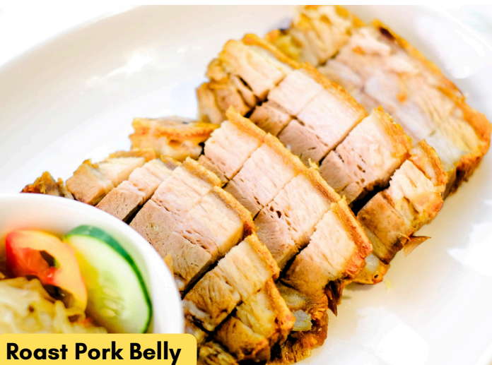
Roast Pork Belly