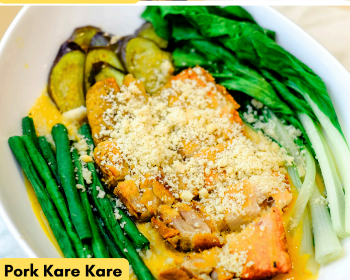
Pork Kare Kare