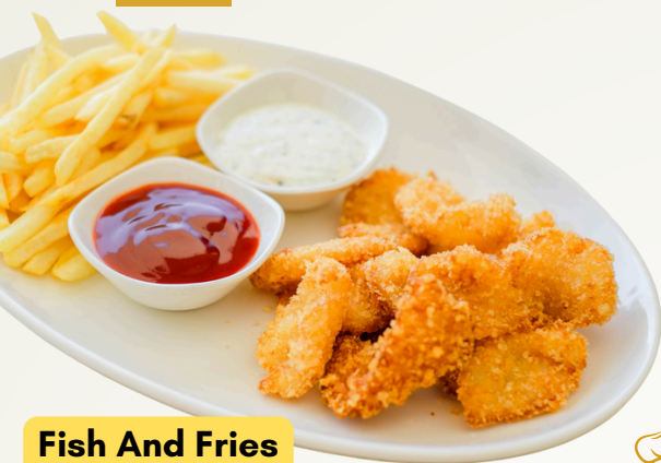
Fish And Fries