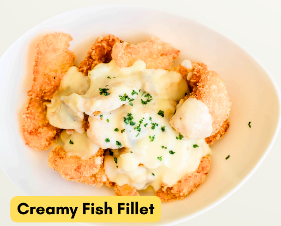
Creamy Fish Fillet

Pan Seared Marinated Garlic Milkfish, Tofu, Mayonnaise Onion, Ginger, Chili