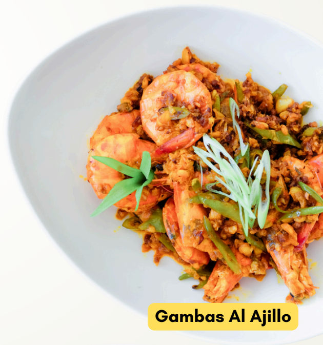
Gambas Al Ajillo