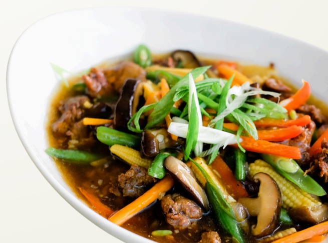
Stir Fried Beef With Vegetables