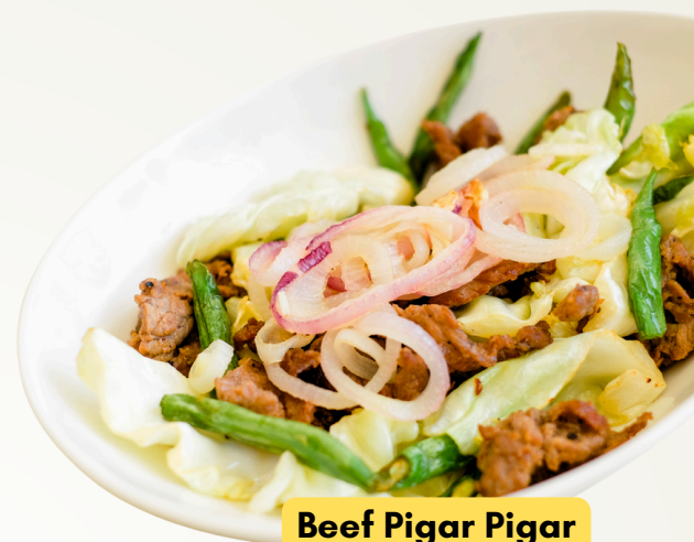
Beef Pigar Pigar

Sliced Sirloin Beef, Mushroom, Garbanzos In Creamy White Sauce