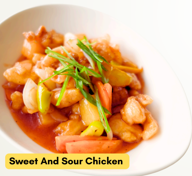
Sweet And Sour Chicken