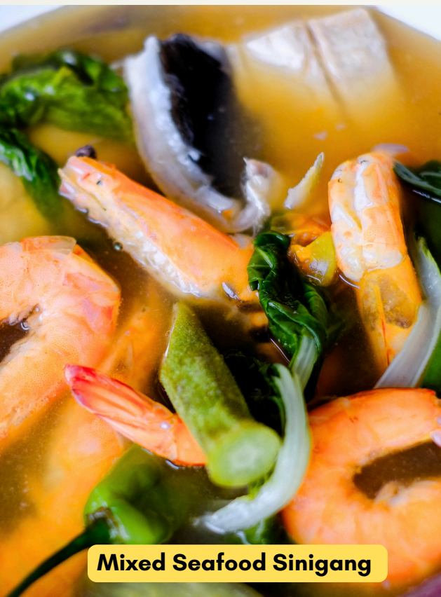
Mixed Seafood Sinigang